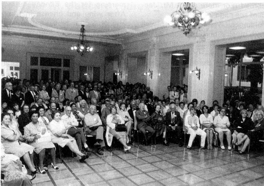
During the official opening