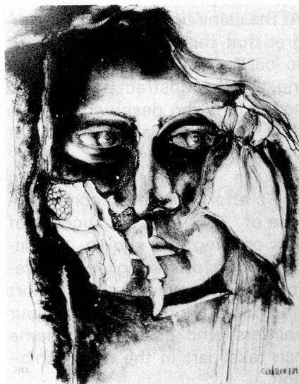
Claudia Butler «Metamorphosis» (USA)

After 5 p.m. the exhibition was opened to the public. An outstanding art critic passed the following judgment on the over 120 works exhibited: