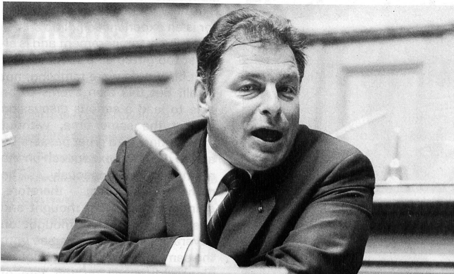
Mr. Jean-Pascal Delamuraz, Federal Councillor