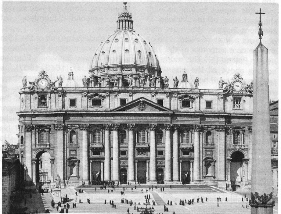
Facade of St-Peters-Church in Rome, with the well-known Obelisk (right).

Talking of the Romanesque period, we note that its influence through the intensive activities of the Ticinesi – in Italy and elsewhere – will remain evident for ever. Another equally prolific pe-