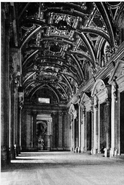
Entrance to St-Peters-Church with its stucco-decorated vault.

St. Peter, where he changed the basic outlines set by Michelangelo. Whenever he had a free hand, he was brilliant, such as when he created the superbly beautiful entrance to a vault in stucco-work; yet far more impressive is the enormous façade dominating St. Peter's Square.