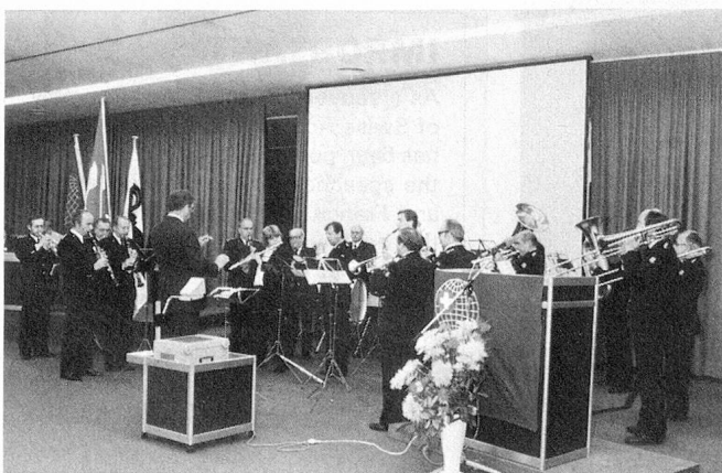
Friday morning's plenary session.