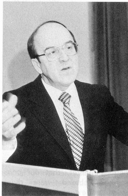
Our guest of honour, Federal Councillor Kurt Furgler.

there were changes. Instead of having the plenary session on Saturday, it took place already on Friday. It began with the official opening at which the Basle Municipal Band entertained the assembled participants. This meeting was the highlight of the whole congress.