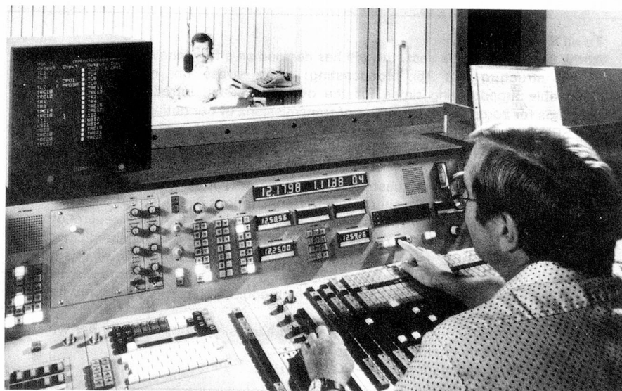
Swiss Broadcasting in 1985

measures needed to remain in effect over a longer period of time. This small working team withstood the critical time of the war years. The «Swiss Broadcasting Service, Short Wave Dept» proved itself to be a welcome pillar of support against the tide of perfidious propaganda of that time. This activity very soon needed round-the-clock work. The broadcasts in foreign languages were increased, and in close co-operation with the «Landessender» studios, a world-wide basis of trust was established, last but not least, thanks to the support of men, whose names directly due to this work, achieved world-wide renown, like Prof. J.R.von Salis and René Payot. The initial line of thought of the pioneer Borsinger and therefore quasi the «de jure» recognition as the seventh studio of the SRG, was accorded the official embodiment much later in the year 1953.