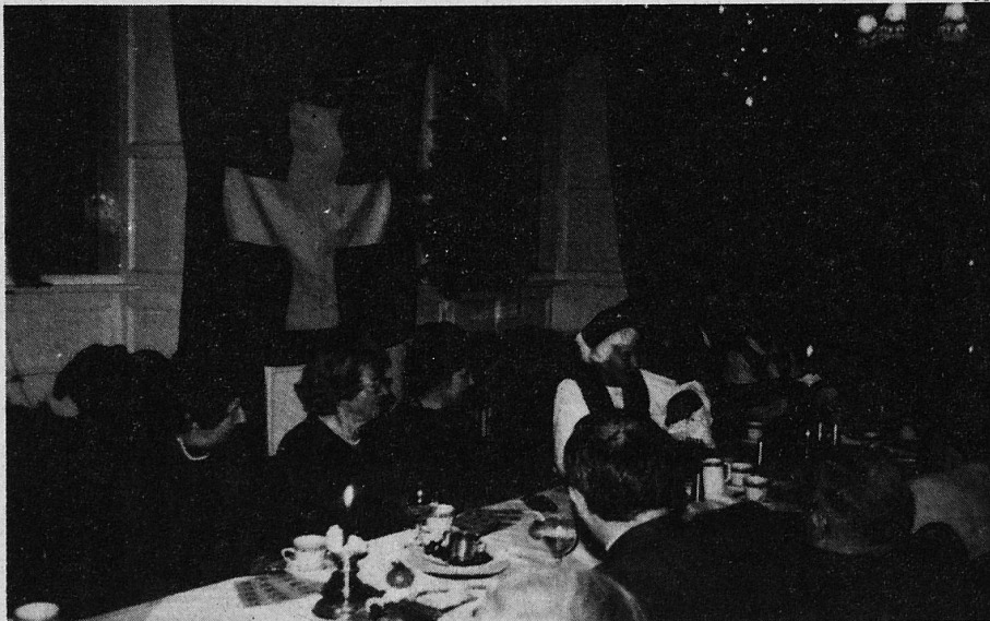
Christmas Party – Paignton