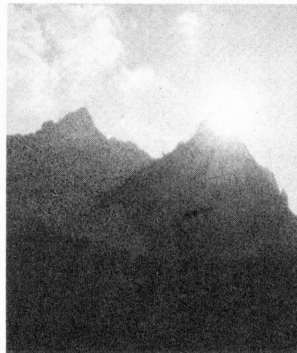
Mythen (Canton Schwyz)