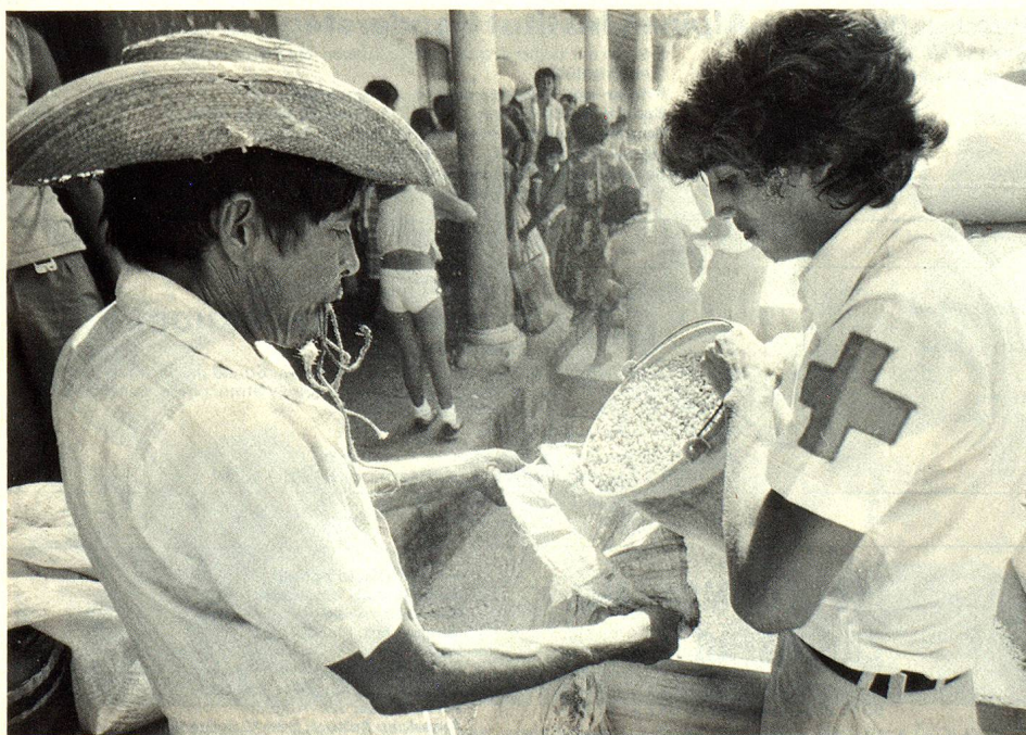
The ICRC distributing frijoles, the basic food of the people of El Salvador.

Can the damage caused be contained and, with the time, repaired? Or will there now follow, bit by bit, in the Red Cross too, the nauseating spectacle of the expulsion process against the pariahs of weltpolitik ? The next is the likely danger of a new blowup in the tug-of-war over the ratification of the Geneva additional protocols of 1977, which was intended to be speeded up by the conference. Like a few European states, the Reagan administration has given notice of reservations against texts which in its eyes appear as legitimizing guerilla fighters and terrorists.