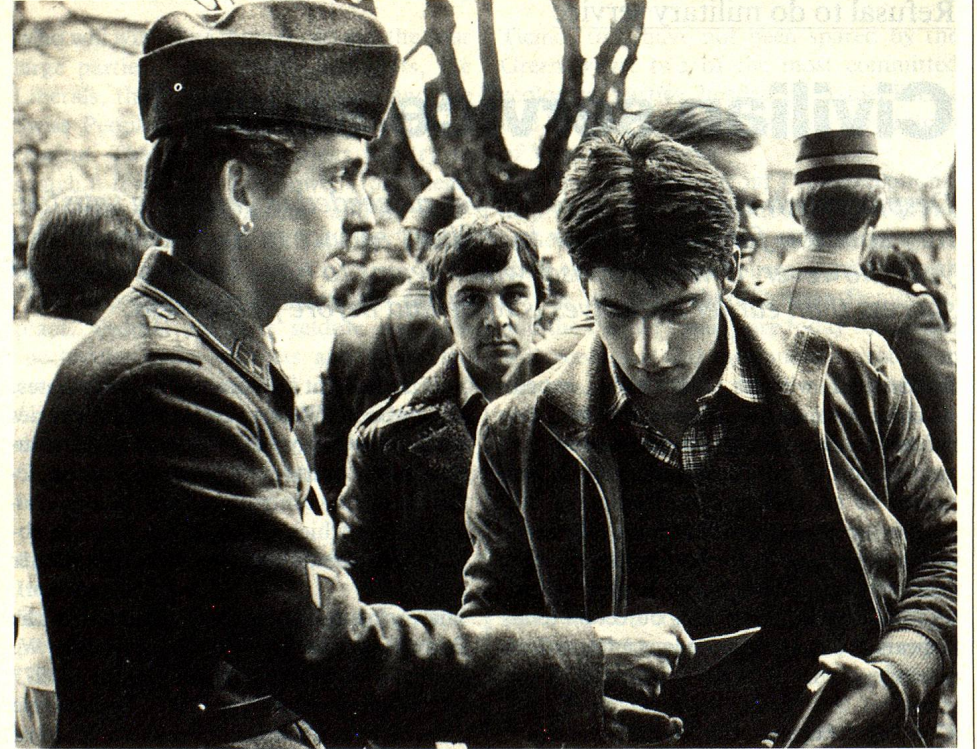
Conscripts' first day.