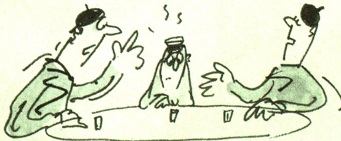
Nightmare picture: language problems. Well prepared - not to worry.

question or passing of an entrance examination.