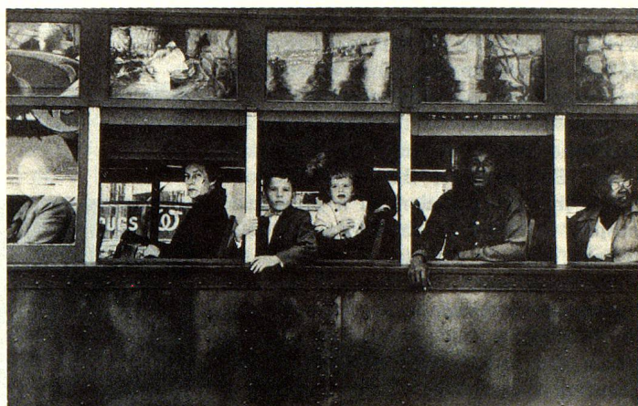
Robert Frank, New Orleans, 1955-1956