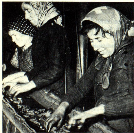
Sorting coal, Valais, 1947.

Thus Switzerland is certainly not so poor in raw materials as it is always made out to be. That, because of the inevitable damage to the environment, mining in the grand style is