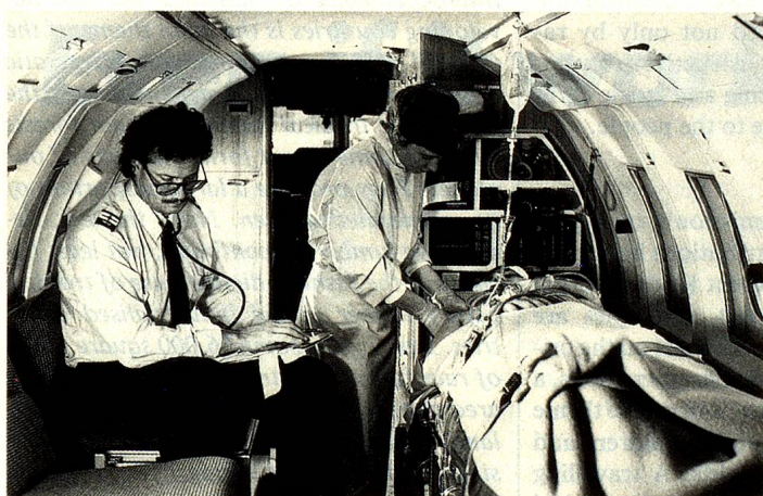
Last year, Rega ambulance jets were called out on nearly 800 missions abroad. Our picture shows the interior of a new aircraft put into service in March 1988. This is a British Aerospace BAe 125-800 B-type ambulance plane with two intensive-care stations and, in all, three berths.

Its permanent readiness for action and highly professional organisation make the Rega (short for Rettungsflugwacht and Garde Aérienne) a lifesaver. Fifteen rescue helicopters, three ambulance aircraft, sixteen permanent doctors, ten anaesthetist or intensive-unit nurses, ten flight helpers with medical training for emergencies, forty pilots, twenty technical service staff and twenty task force leaders guarantee round-the-clock operation 365 days a year.