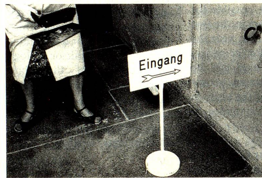
It's not always easy to find your way through the maze of bureaux.

The New Helvetic Society's Secretariat for the Swiss Abroad (SSA) , on the other hand, is a private institution. It is the secretariat of the Organization of