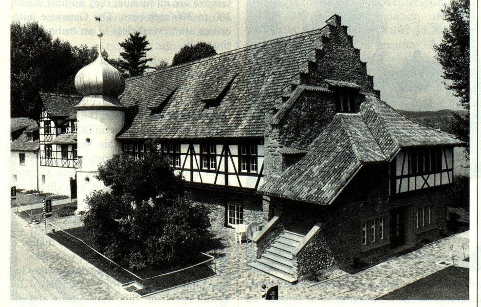
... to the Lake of Constance (refectory of the former Cistercian Monastery in Steckborn, Thurgau): Multilinguality creates problems.