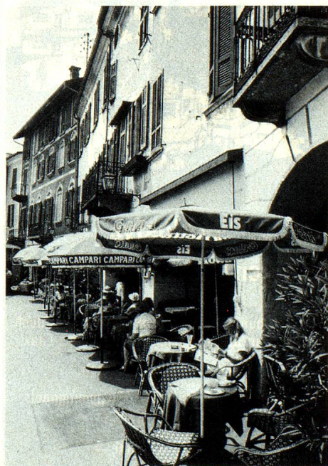
More «Eis» than «gelati» in Morcote? Advance of the German language in Ticino.