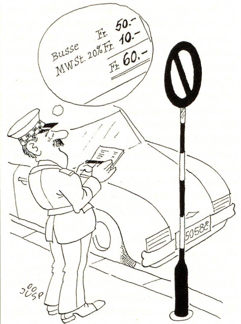
VAT soon in Switzerland too?

The Federal Council does not want to undermine the three political maxims mentioned above – and this is the reason why it (and probably the majority of parliament) will not consider EEC membership. Then independence, neutrality, autonomy count for more than anything else. That is a very feasible attitude – however, a lot of illusion naturally accompanies the belief in our autonomous and independent future.