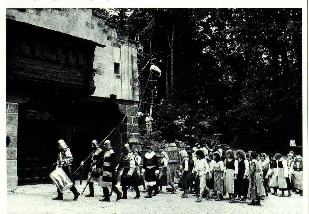
Probably the best known open-air theatre in Switzerland: The Tell Plays in Interlaken.

On these same lines, the little Bernese town of Laupen is preparing to commemorate a noteworthy battle. The opponents of the day were Fribourg and Berne, pushed by their respective allies: The Burgundians and Habsburgs on the side of Fribourg, and