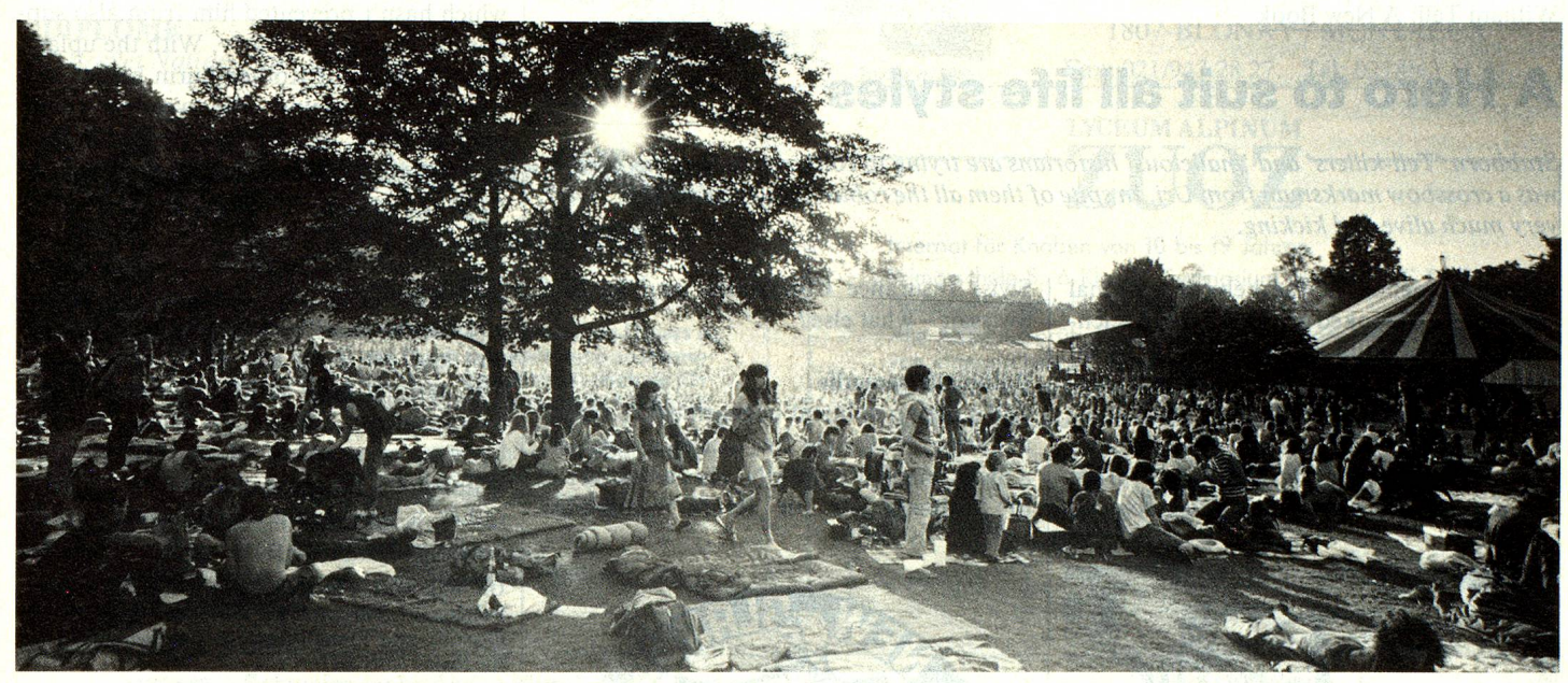
There is always a relaxed and light-hearted atmosphere at open air festivals - if the weather is pleasant.