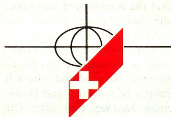
New Foundation: new logo.

The Spring Session of the 'Parliament of the Fifth Switzerland' had an historical character this year. The delegates coming from all corners of the world convened under the old legal conditions for the last time on Friday 3 March 1989, to deal with pending business. Festivity was then the order of the day on Saturday morning. The Council of the Swiss Abroad assembled in the Hotel Bellevue-Palace in Berne to celebrate the creation of the Foundation of the Organisation of the Swiss Abroad,