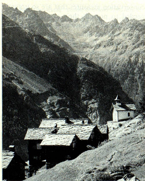
Heimischgartu, an old Walser settlement at 2110 metres above sea-level, on the road from the Saas valley over the Monte Moro pass to Macugnaga.

The Swiss National Tourist Office has been endeavouring to encourage people to undertake walking tours along the Great Walser Route. The entire trail comprises 50 sections, making up a total of some 850 kilometres (about 528 miles). Apart from the mountain and glacier tours, passing over the Theodul Pass, the individual stages call for some stamina and energy, but experts state that they are "fairly easy to undertake". The route proposed is not absolutely identical with the path followed by the original Walsers in their emigration, but it has been planned to take one past leading sites of Walser culture. "It is a journey to tell us more about the life of these extraordinary