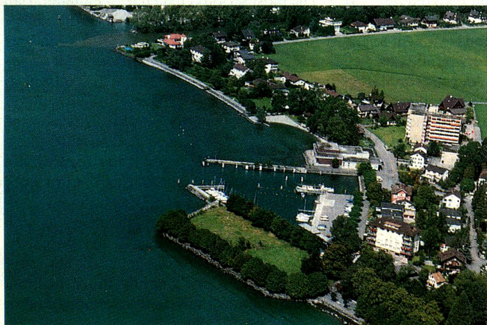
Expatriate Swiss architects will be proposing designs for the treatment of this peninsula.

Participation will be open to architects who are Swiss citizens who live and have their places of business abroad. Participation in the contest will be by invitation in accordance with Article 10 of the abovementioned SIA Ordinance 152/72. From the applications received, the jury will select seven candidates who will be officially invited to take part. There is thus no point in submitting suggested designs at this stage. A brief letter stating one's desire to participate in the contest will be sufficient.