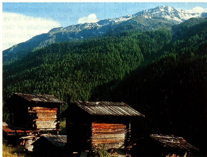
Val d'Anniviers