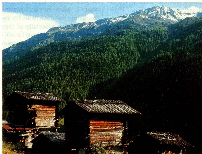
Val d'Anniviers