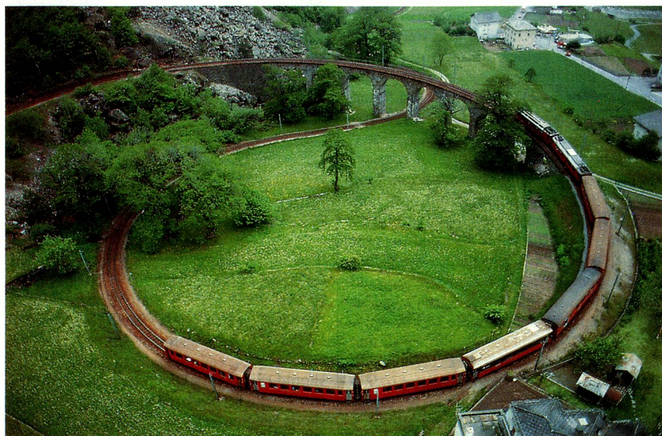
Circular viaduct to overcome the steep gradient near Brusio in the Poschiavo region.

On October 5, 1889 the inaugural train drove through the Prättigau region on the railway line from Landquart to Davos. That was the very first line of what is today called the “Rhätische Bahn” (“RhB”). Strictly speaking this would in English mean “The Rhaeto-Romanic Railway”, the name being