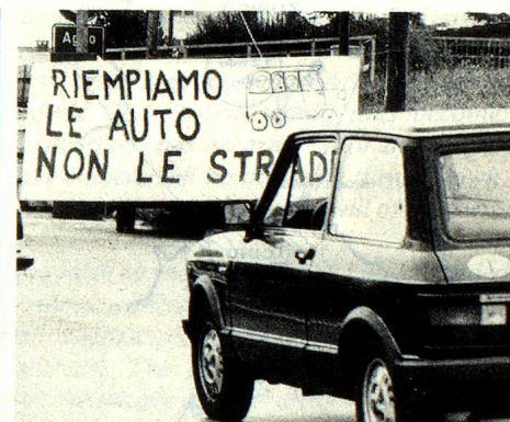
Protest against car commuters in Malcantone: 'Let's fill the cars and not the streets.'

graphical and political invariants. (Bottinelli 1984).