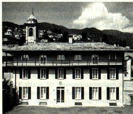
The Casa Rusca in Locarno houses the town's art collection and the Hans Arp collection.

Ask a tourist on the street why he loves Ticino: whether on Lugano's promenade, under the arcades of Locarno or on the footpaths overlooking the lakes, the sort of answers you will get are likely to be the same everywhere: The sun, the mild climate, the merlot wine and maybe even the ...pizza,