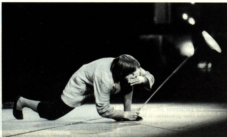
The world famous clown Dimitri in action.

On the other hand, top class summer events, like the Locarno Film Festival and the Ascona Music Festival Weeks, are winning widespread acclaim. Their increasing popularity is such that the organisers are faced with space problems with each new festival. After the decline in interest in the seventies, the Film Festival has once again found its function as an interesting platform for less well-known producers, as well as for the insatiable film lovers whose numbers are steadily increasing. It would, though, be wrong to talk of a genuine interest of the general public in the cinema. Often it is rather a matter of the mundane rather than the cultural event: Apart from the festival days (and with the exception of Lugano), Ticino cinema programmes are way behind those of the cities north of the Alps, and the audiences sparse. Quite the opposite to the sold out concert halls of the Ascona