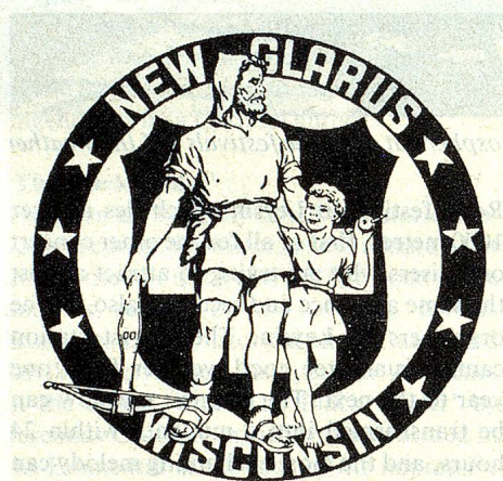
...on a World tour (Swiss settlement New Glarus in the U.S.A.)...

Tell's active political engagement is rather irritating. He fought for, as well as against, a Swiss entry into the UN. He has voted for the Communists on several occasions,