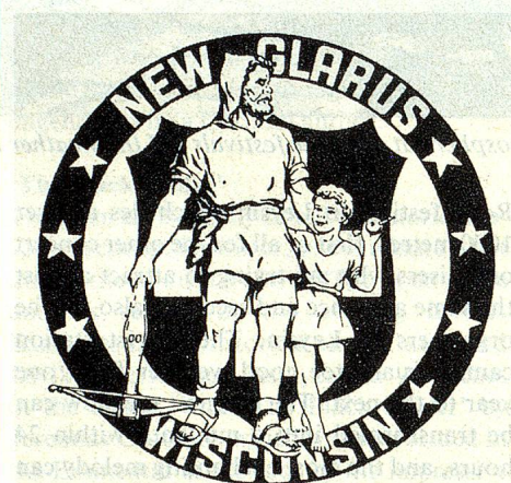
...on a World tour (Swiss settlement New Glarus in the U.S.A.)...

Tell's active political engagement is rather irritating. He fought for, as well as against, a Swiss entry into the UN. He has voted for the Communists on several occasions,