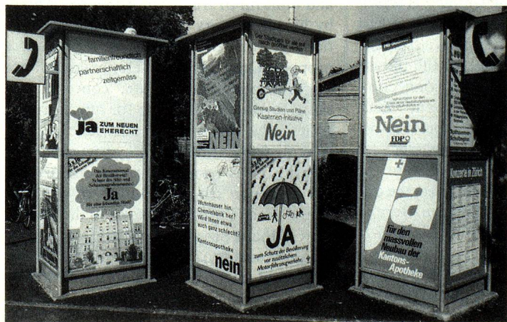
Dozens of proposals are voted on every year – on a communal, cantonal or Federal basis: direct democracy is a typically Swiss form of democracy for everyday use.

So now we have arrived from the way the Swiss feel that they own their country, via popular direct democracy and cantonal autonomy, to the questions of regional collaboration and of Europe itself. The systems prevailing in Switzerland give the Eastern observer a sort of "compass", the needle of which points inside the country in the direction of small communities which can freely organise themselves, but outside in the direction of a Europe that is striving to dismantle the "blocs" that now exist, and in which regions with greater autonomy than now will be able to collaborate with one another. Switzerland remains outside the EC but continues to expand and develop its economic contacts with "The Twelve" – something that is most instructive to a Hungarian observer: it shows that adhesion can be rejected on political grounds without disturbing relations in the sphere of commer-