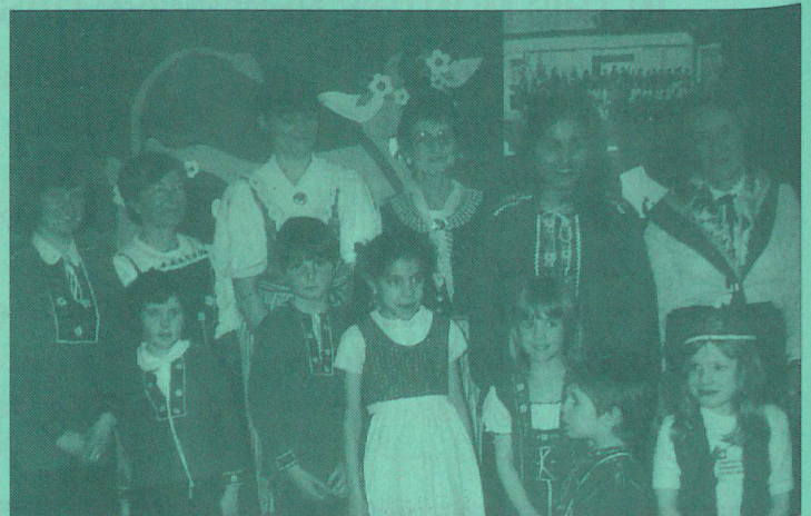
Some of the members of Surrey Swiss Club in traditional and festive mood.