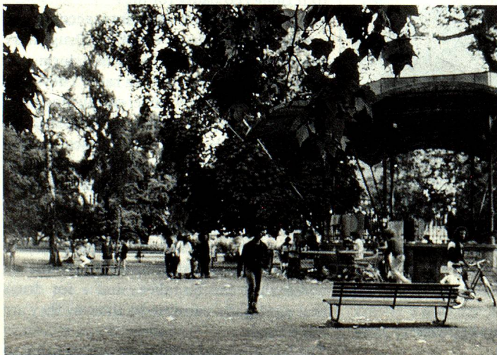
The present drug centre at Zurich's Platzspitz