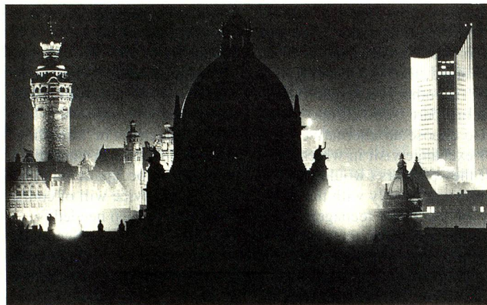
The account-keeping GDR financial institutions will convert national foreign currency accounts into DM on request. Picture: Leipzig by night

As part of the financial reforms in the GRD, the West German mark (the DM) became the official currency of the GDR as from July 1 1990.