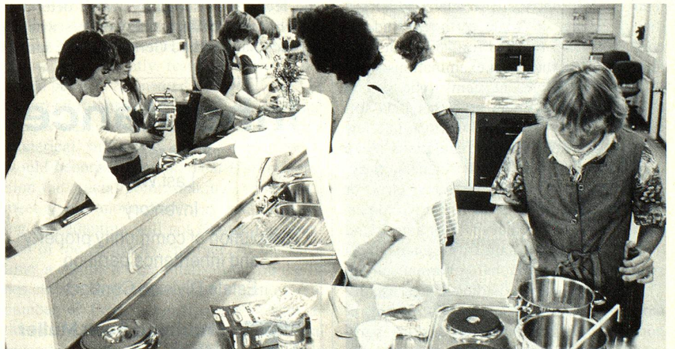
During certain lessons, teachers prefer the dialect as an intimate language to the standard German with "gentrified" overtones.

Already before the outbreak of the First World War ("The Great War") in 1914 the first strong counter-movement against this cultural infiltration by foreign elements (known in German as "Überfremdung" and as "noyautage" in French) started in Berne and quickly gained prominence all over German Switzerland after the defeat of the Reich. In the post-war period, with its emphasis on democracy and federalism, for both of which concepts the various cantonal dialects could be seen as symbols, this trend became stronger, and even more so in the WW II era of "spiritual defence of our country", when it was even encouraged by the State authorities as a bulwark against National Socialism. After this second pro-dialect movement, there followed a period of calm until in the early 1960's, when the German-Swiss awoke from their period of lethargy, with Frisch and Dürrenmatt again making