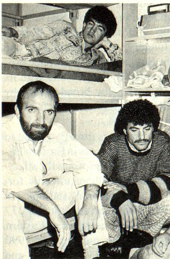
Hoping for a better future.

This book can be ordered from: Secretariat for the Swiss Abroad, Alpenstrasse 26, CH-Berne 16. No charge for postage.