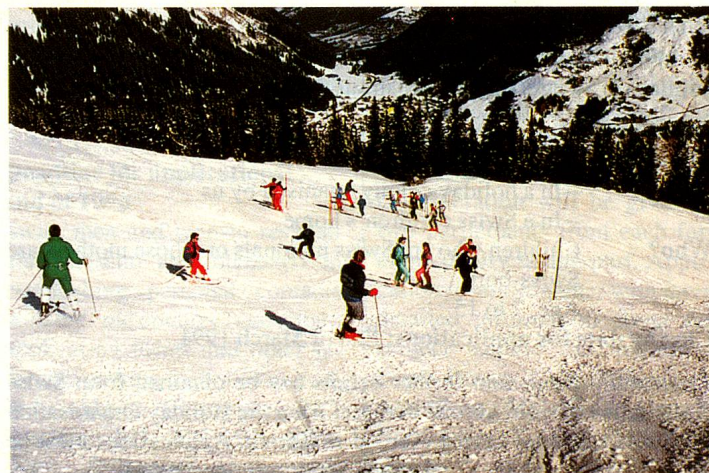
Attractive offers introduce participants to the art of skiing – and it's fun, too.

Registration: Deadline for applications is 18-02-91. Forms are obtainable from: Auslandschweizer-Sekretariat, Jugenddienst, Alpenstrasse 26, CH-3000 Berne 16. The number of participants will be limited to 60.