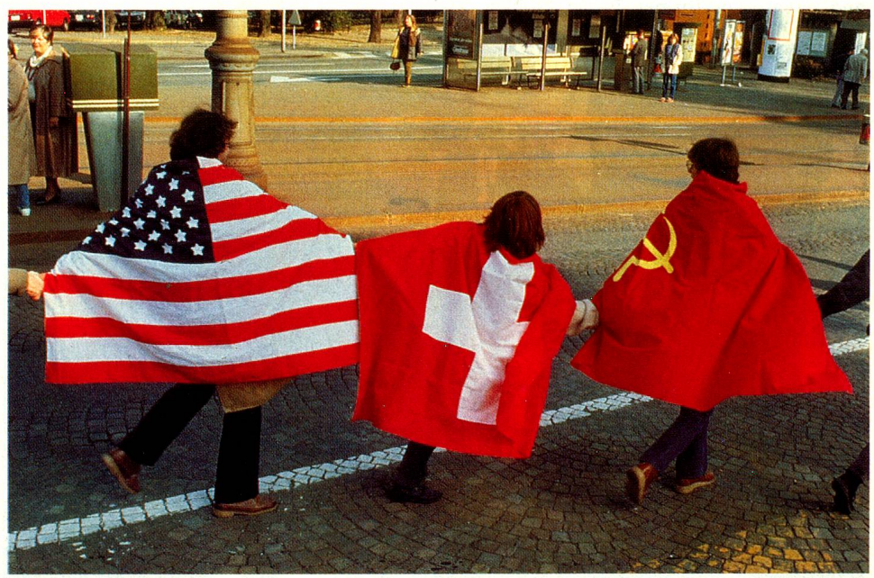
East and West hand in hand.

These range from a child’s school via the «school for men» (i.e., scenes from military service) to the entertainment in a disco, that was banned later on. In a contrasting manner, the taboo of death is followed by a ball organised by the Officers’ Club, then huts where asylum-seeking refugees are housed, alternating with children at play and other children who are ill. Under the ambiguous heading «Switzerland’s Climate» one sees a computer in a cow-shed, alongside of a pic-