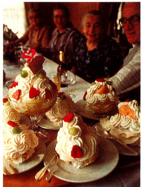
Classical dessert from the Emmental.

ticularly successful photograph shows a horse-drawn cart, which had to brake abruptly to avoid a collision with a solar-powered passenger car (see our illustration). One common feature of this collection of pictures on the theme of Switzerland is that at first glance, one sees something familiar – as for instance the Tell Monument in Alt-