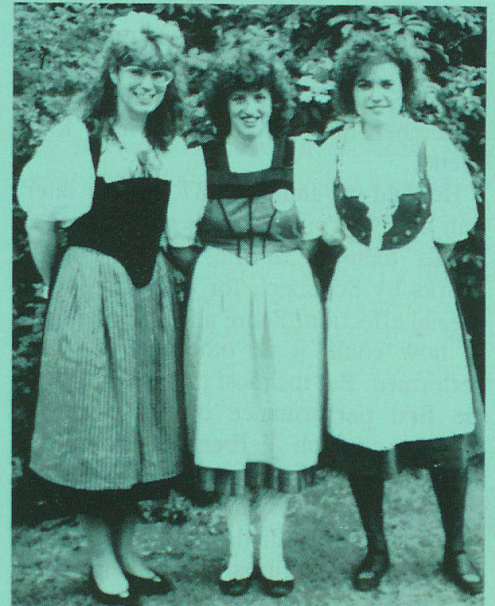
Swiss Youth Club members in traditional costume