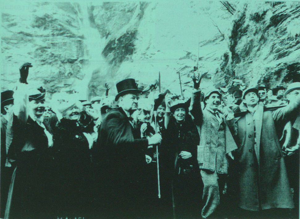
The Sherlock Holmes Society at Reichenbach