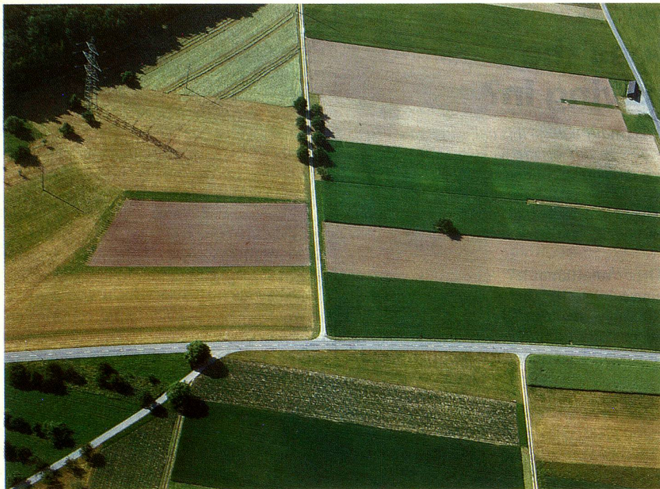
Will such countryside in a few years be transformed into a single metropolis with some parks?

more dual income families without offspring, which lightens the burden somewhat.