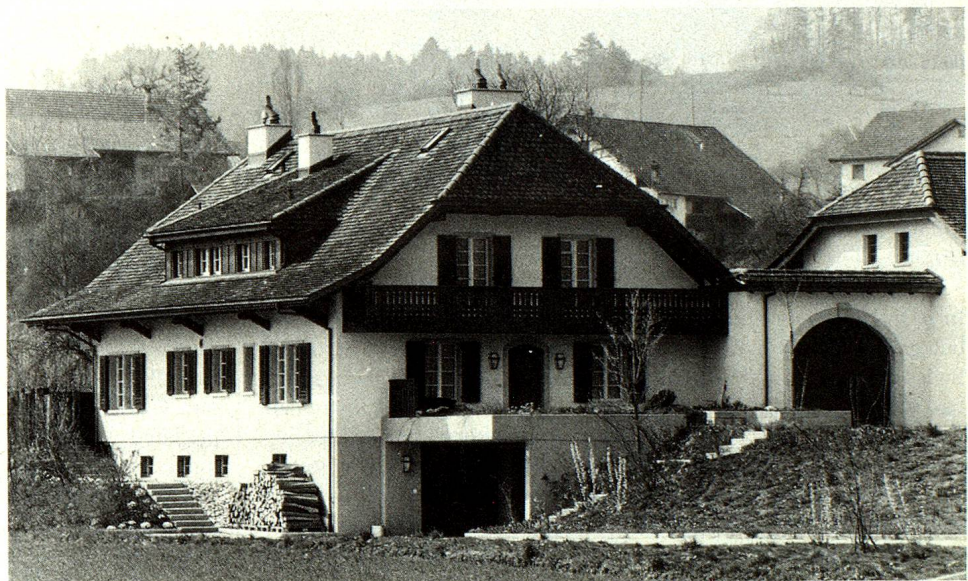
In comparison with other European countries, Switzerland ranks low: only 30% of the apartments are occupied by their owners.

Many observers fear that in a few years, or maybe decades – and apart from those regions where mountain ranges stand in the way! – the whole of Switzerland will consist of a single gigantic metropolis interlarded with plenty of parks. On these stretches of "park" land, farmers would still be able to cultivate their meadows and orchards. There is no doubt that a vast majority of Swiss would like