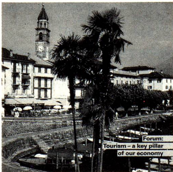
The former fishing village of Ascona on Lake Maggiore, lined with palms, attracts many tourists.

The Magazine for the Swiss Abroad 2/91 June 1991 Sfr. 3.-