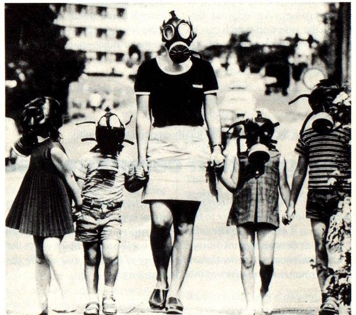
Air pollution in Switzerland reaches critical levels even outside the cities.

On 15 October 1988 the newspapers reported the sad news about a seven-years old Turkish boy