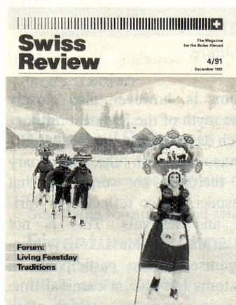
The Appenzell masked beggars of old have turned into the picturesque mummers of today – Switzerland's best-known New Year's attraction.