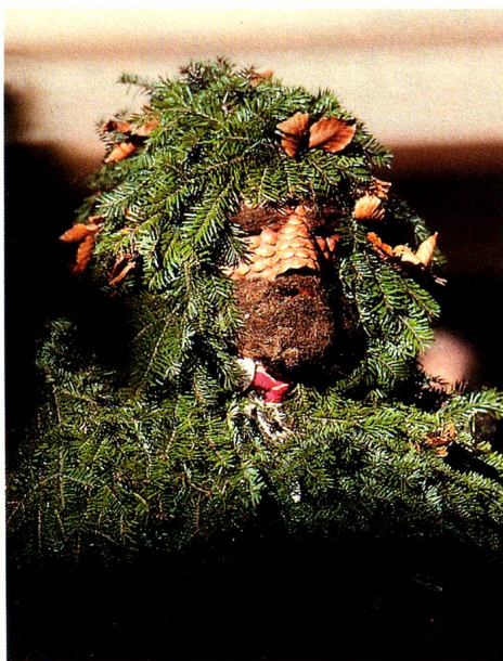
The masks of the "pretty-uglies" often feature pine cones, bark, branches and leaves.

Girls are allowed to take part in the children's groups but for adults the "Silvesterklausen" activity is strictly confined to men, in contrast to the "Landsgemeinde" – the annual open-air voters' assembly – to which women have now been admitted at last.