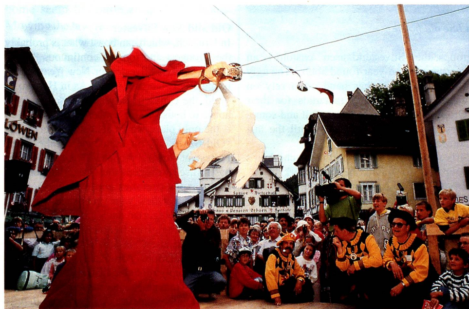
Old customs (pictured here: “Gansabhauet”) evoke a long-vanished, pre-industrial era.

The other “Kläuse” are also divided into “Rollen” and cowbell carriers and they also bring their fellow citizens a New Year treat in