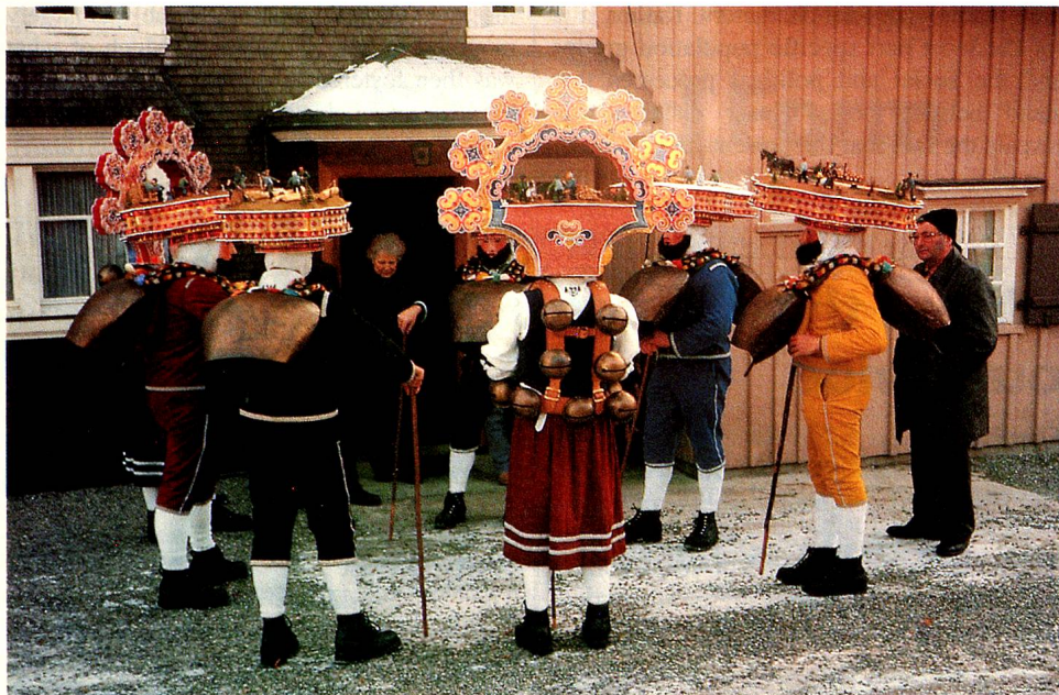
A group of pretty "Kläuse" yodelling in front of a fine old house

the form of yodelling and bell-ringing. But the "wüeschi" (ugly) Kläuse" are so called because of their frightening papiermaché masks which frequently incorporate animals' teeth and horns, recalling ancient memories of demons and forest spirits. This impression is heightened by "Gröscht", or costumes made from fir branches, straw and leaves. Although every Outer-Rhodes schoolchild is firmly convinced that the ugly "Kläuse" are pre-Christian in origin, the introduction of this type can definitely be placed in the 1940s and 1950s.