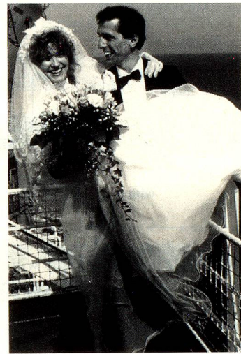
Marriage to a Swiss no longer automatically means Swiss citizenship for a foreign woman.

In such cases, close contact will not be assumed as a matter of course. The Federal Department of Justice and Police accepts that such contact exists if the applicant is fluent in one of Switzerland's national languages, has visited Switzerland on frequent occasions, has close contact with a Swiss association and maintains good relations with people who reside in Switzerland. (Further details will be contained in a special leaflet to be made available by Swiss diplomatic representations abroad from next December).