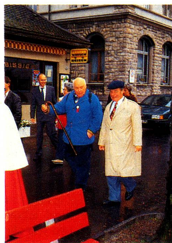
Ulrich Bremi, President of the National Council (left) and Federal Councillor Jean-Pascal Delamuraz (right) in Brunnen.

Unexpectedly for those present – who included local residents spontaneously invited by the