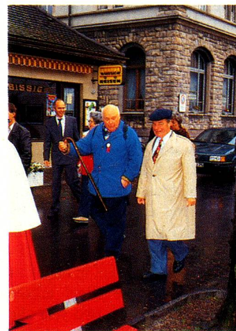
Ulrich Bremi, President of the National Council (left) and Federal Councillor Jean-Pascal Delamuraz (right) in Brunnen.

Unexpectedly for those present – who included local residents spontaneously invited by the