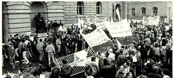
Swiss farmers protest the growing threat to their subsidies.

tives cannot conceal the fact that restructuring is bound to take place in Swiss agriculture, as in that of other European countries. This is due not only to the hoped-for GATT agreement but also to the opening up to the rest of Europe which is bound to take place in the long run in the framework of the European Economic Area.