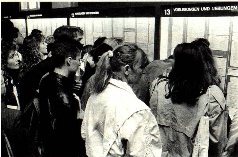
Any student registered at a university in the EC may participate in the ERASMUS programme.