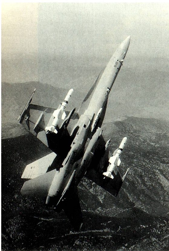
Hornets over Switzerland? The question is still open.

Whatever shape Europe is to have in the year 2000, whether or not Switzerland joins the European Community, "Transport Europe" will have to come about. The author shows that if Switzerland does not want to become Europe's "bad boy" preventing the development of a common transport network between the