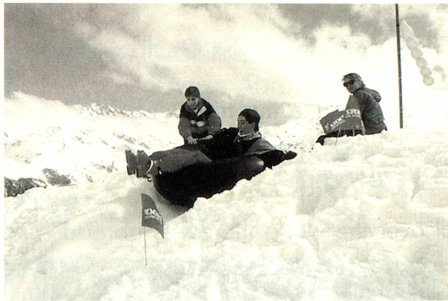
Fun and games are the best part of SSA camps.

So in future Swiss students from abroad have the same status in Swiss universities