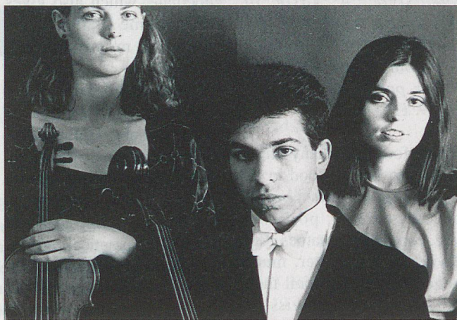
The Rogeri Trio