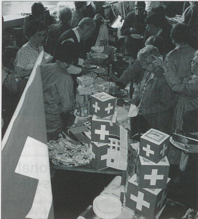
Tyne Tees Swiss Club celebrating Europe