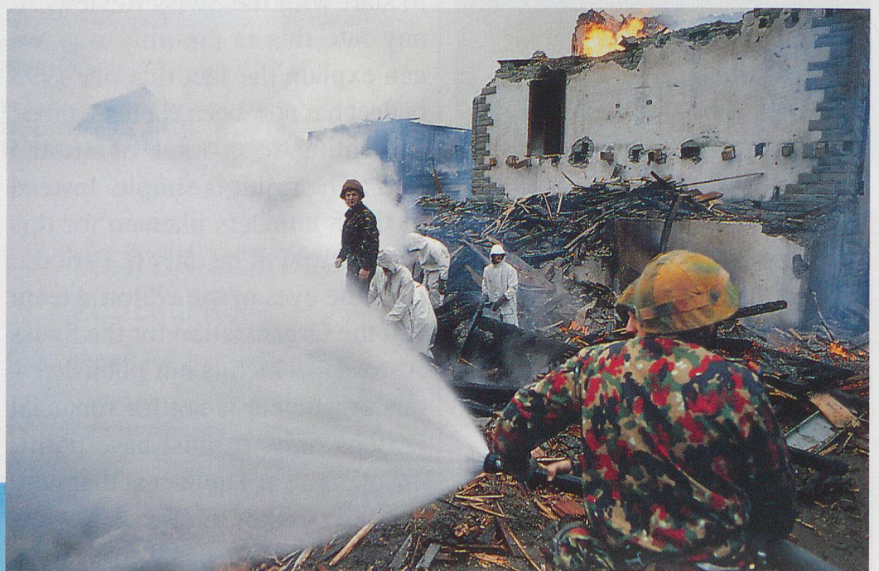
Military fire fighting exercise to save a burning house.

longer a security balance in Europe, even though efforts are being undertaken in the face of innumerable problems to build one (the Maastricht Treaties). Although the danger of world war has receded, the situation in Europe remains extremely unstable. It is marked by the breakup of the USSR which has been accompanied by violence in many places, by the terrible civil war in ex-