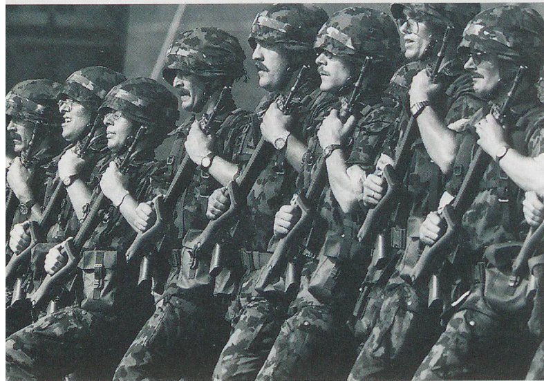
The Army '95 concept includes a careful combination of work...