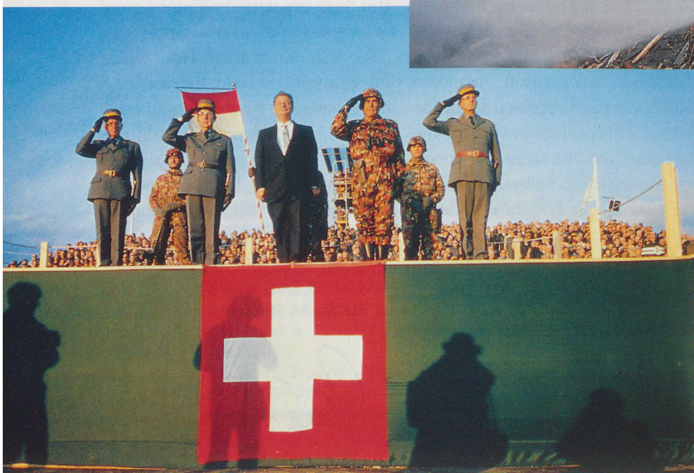
At a military parade, with Jean-Pascal Delamuraz at centre

Yugoslavia whose cruelties provide a grim reminder of the Second World War, and by the increasing threat of escalation throughout the Balkans. Nor is central Europe free from nationality conflicts and inter-state tensions leading to further divisions, as in the case of former Czechoslovakia. Western Europe has not been totally isolated from the nationalist virus, which is seen in autonomy movements like the Italian